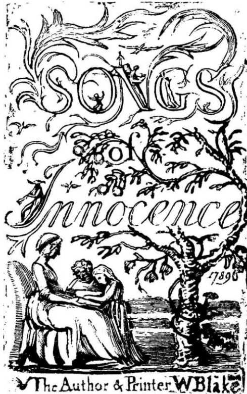
Title page for Songs of Innocence (1789)

"Drop thy pipe thy happy pipe 10 Sing thy songs of happy cheer"; So I sung the same again While he wept with joy to hear.